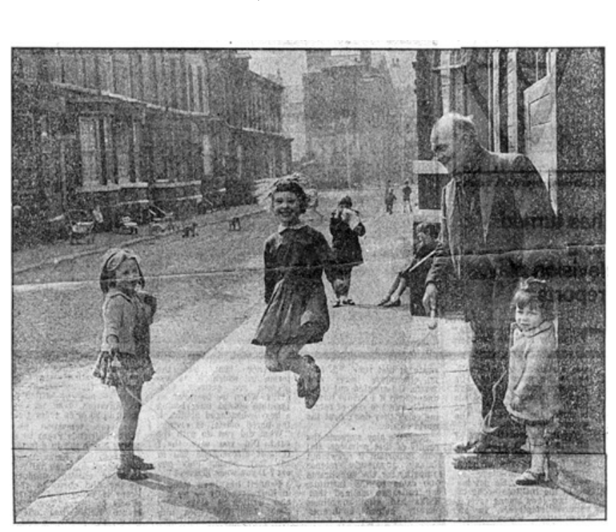
from the Images of Salford exhibition at Salford Art Gallery, 1986

For most people Hollywood is a realm of fantasy; I landed up there, but found its brand of fantasy pale by comparison with my junk-filled memories of Salford; and even the fabulous Orson Welles could never displace my father as the most colourful character in my life.