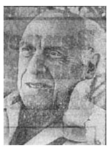
The contemporary George Coulouris